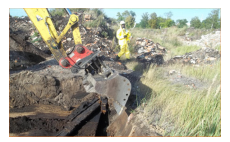
Figure 3: Contaminated underground installation found during excavation works (done during the preparation for the soil washing field tests within the TIMBRE project)

vestigations made for private (2001) and public (2009) plans of investments. In addition to the creosote, mineral oil and PCBs were used as additions. Many creosote components are toxic and carcinogenic (e.g. Naphthalene, Benzo(a)pirene, Benzene). The heavy pollution of ground and groundwater makes remediation difficult and expensive, so the area is abandoned as brownfield.