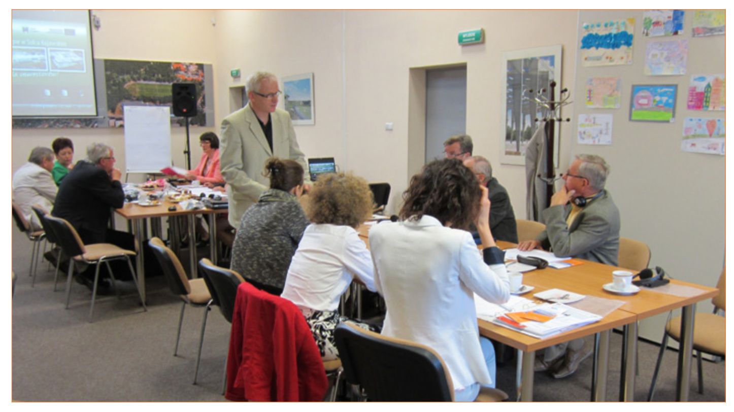
Figure 8: During the "world café" discussions

project "COBRAMAN" where a database was developed as well as materials for courses to train brownfield managers.