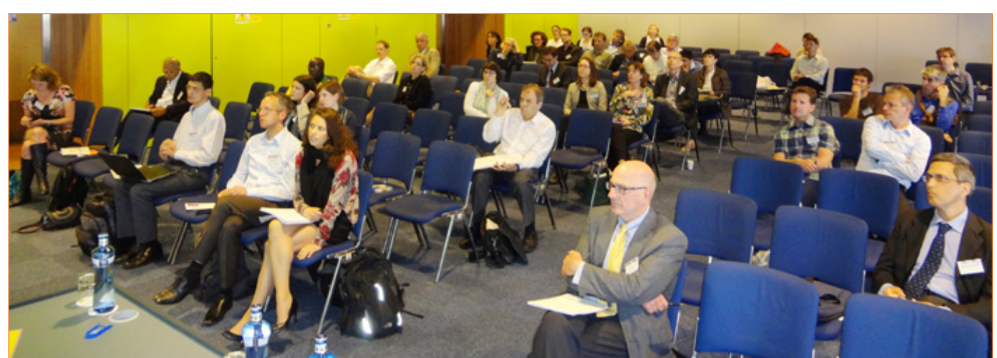
Figure 1: During the session on "Sustainable Brownfield Regeneration – synergies with the land cycle and the role of new tools and technologies"

The session started with an introduction to the projects "HOMBRE" and "TIMBRE" and their focus with regard to the land use cycle. Both projects see the importance of involving stakeholders to better understand and integrate their requirements of any regeneration process. This means that any measures developed by HOMBRE or TIMBRE must meet the needs of a wide range of stakeholder needs to gain acceptance. While HOMBRE and the tools developed in its work packages address and try to support stakeholders in all phases of the land use cycle, TIMBRE has a more specific focus on a certain phase of the land cycle where brownfields have already emerged.